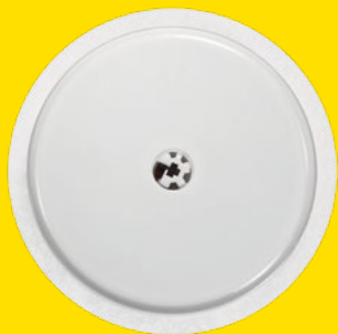
FreeStyle Libre 2 sensor