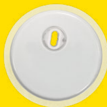
FreeStyle Libre 3 Plus sensor